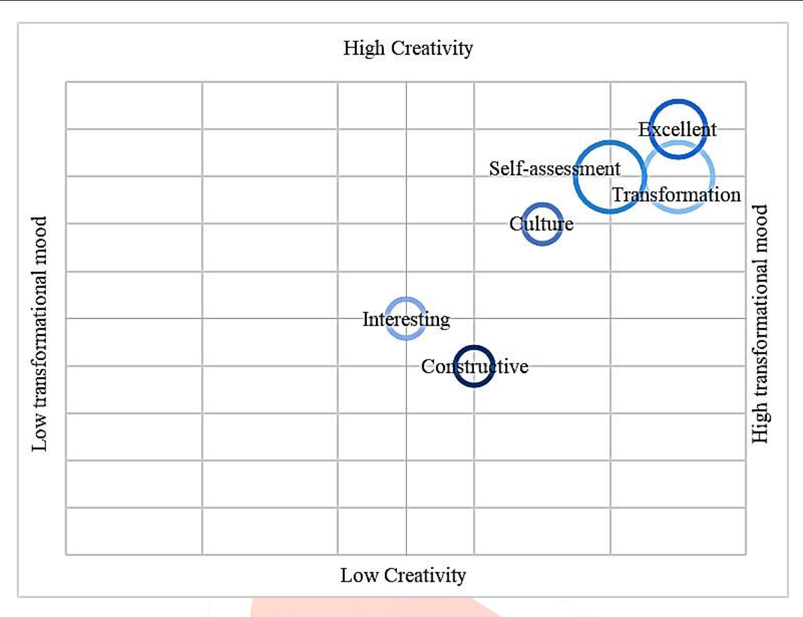
Figure 2. Perception map of adult educator as a Mentor