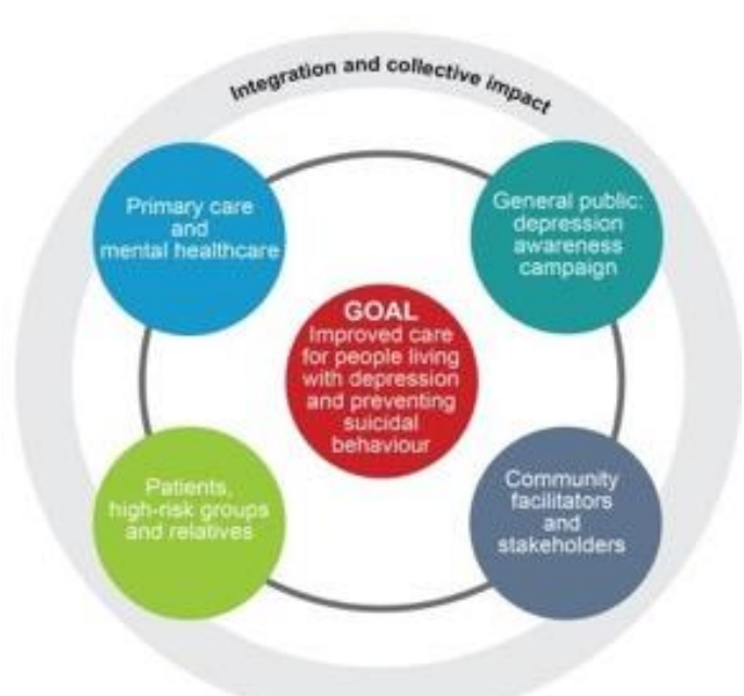
Fig. 2 Integration and collective impact