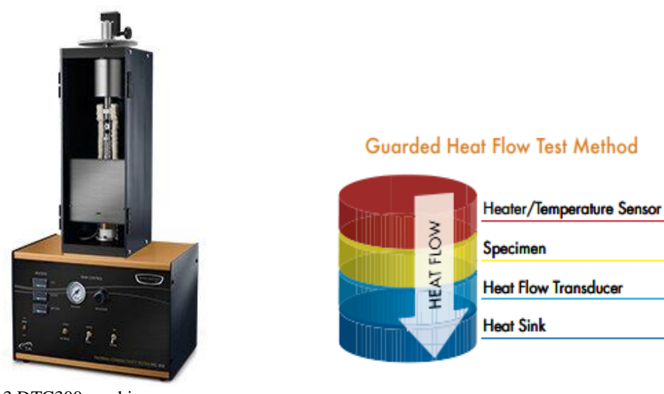
Fig. 3 DTC300 machine