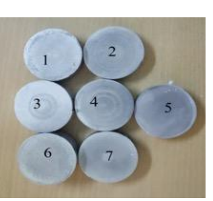
Fig 2: Sample of thermal conductivity

The samples were prepared by squeeze casting and prepared sample for thermal conductivity test according to the ASTM E1530 standards of Dia. 50mm, then the samples are done with polishing with sand paper with grades of 400,600,800 for the polishing of the sample. Again for finish polishing Disc polishing machine is used to get desired finish for the samples to thermal conductivity test. The samples after polishing in disc polishing are as shown in the fig.2