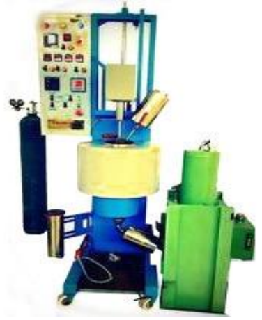
Fig.1: Squeeze casting diagram

The close contact of molten alloy with the metal die surface results in minimum porosity and improved mechanical properties.