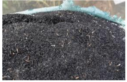
Fig. 1. Rice husk ash Table 1. Chemical properties of binding materials

The ordinary Portland cement (OPC) 53 grade of Ultratech company is used in the series of cement operations. Fine aggregate(Sand) is taken from the river Godavari. A crushed coarse aggregate of 20mm and 10mm produced from the RMC plant near KIMS medical college, Amalapuram was used. The collecting rice husks have a very low nutrition value and as they take very long to decompose are not appropriate for composting or manure. Burning process is adopted at Hotel of Palivela Viilage, Kothapeta mandal of East Godavari district under control temperature below 800degree centigrade produces ash with silica mainly in amorphous form.