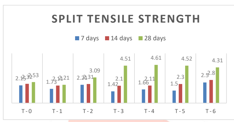
Graph2. Comparison of Split tensile strength of Trials