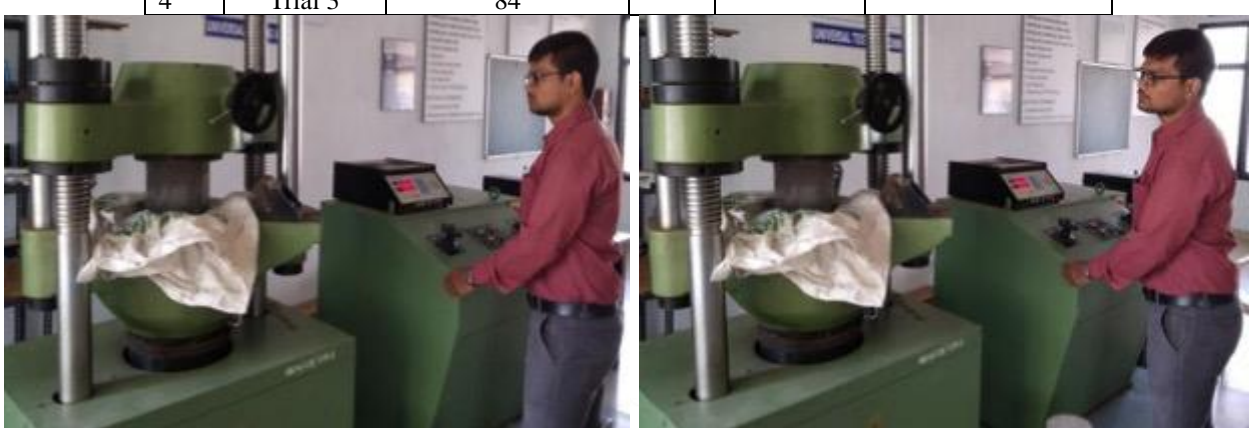
Fig 5. Compressive strength test apparatus