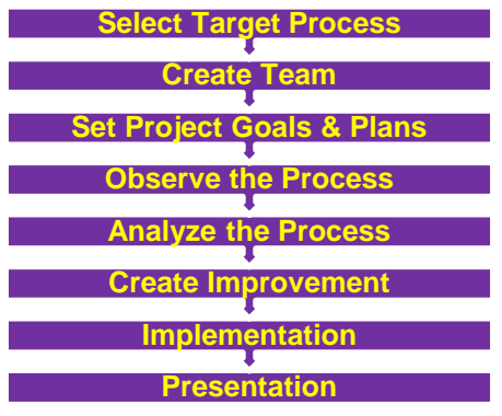
Fig. 1 - Methodology of Kaizen

Kaizen methodology can be used in different fields like engineering, manufacturing, management and other supporting processes in organization. The methodology of Kaizen is also identified as Deming's PDCA Cycle or Shewhart Cycle. The methodology of Kaizen is illustrated in Fig 1(www.satistar.com).