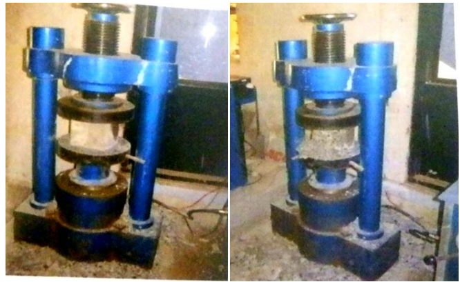
Fig 1 Compression test

Concrete samples were made by using ordinary Portland cement. The composition of the mortar mix is shown in table -2. Moulds with dimensions of 150 mm× 150 mm× 150 mm. After casting, all moulds were placed in a normal temperature of room with a relative humidity of more than 90% for a period of 24h. After de-moulding, the specimens were placed for the curing At the time of testing, cubes were took out from the water, excess water was wiped out by jute cloth and placed it on the platform of compression testing machine. 7^{th} , 28^{th} and 56^{th} days compressive strength was measured. Compressive strength results are shown in table -3.