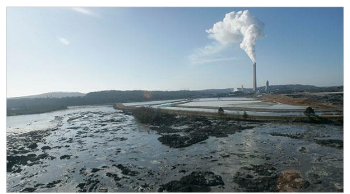
Fig -1 Fly ash pond

A pozzolan is siliceous or siliceous and aluminous material which, in itself, possesses little or no cementitious value but which will, in finely divided form and in the presence of water, react chemically with calcium hydroxide at ordinary temperature to form compounds possessing cementitious properties (ASTM C618).[3]