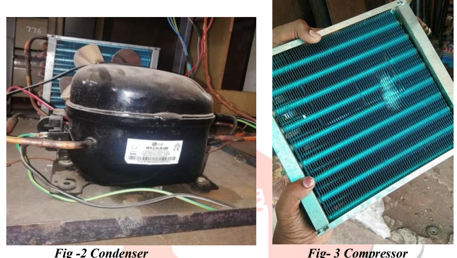
Fig -2 Condenser