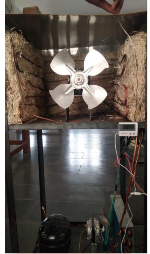
Fig-5 Portable Air conditioner

The ultimate effect of the under-cooling is to increase the value of COP under the same set of conditions.