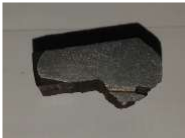
Figure 2.3 eteched sample of 1x1" sample of drum brake

Thickness of brake lining is reduced by 1mm and on brake drum is reduced by 0.4 mm Wear on brake linings is seen and decrease in thickness of brake lining is seen There is two body abrasive wear on linng is seen as the liner materials is removed or cutted by the brake drum and straight lining is seen on liner and material is removed from liner so it is expected that to replace the liner after every 5000 kms