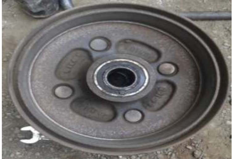
Figure 2.2 used drum for microstructure and Ra value Comparison of thickness of brake drum and lining of new and used brake to find the amount of wear