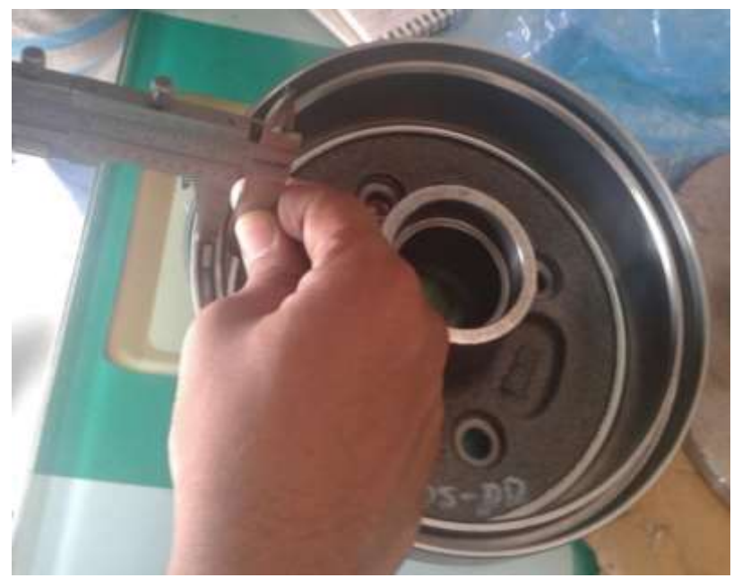
Figure 2.1 New Drum brake for Ra value