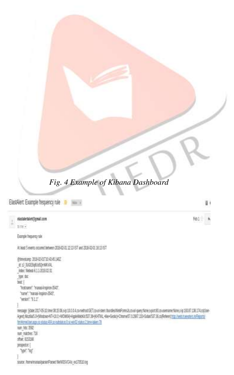
Fig. 5 Example of an email notification