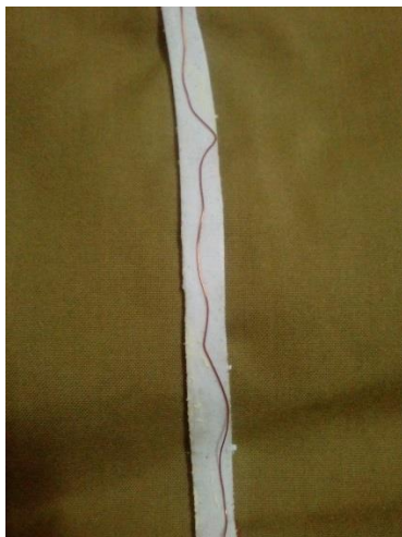
Fig3.simple module of jacket

A simple module is shown above in fig3, how the copper wires can be spread; only two lines are shown, similar to this we can implement several copper wires all over the material .