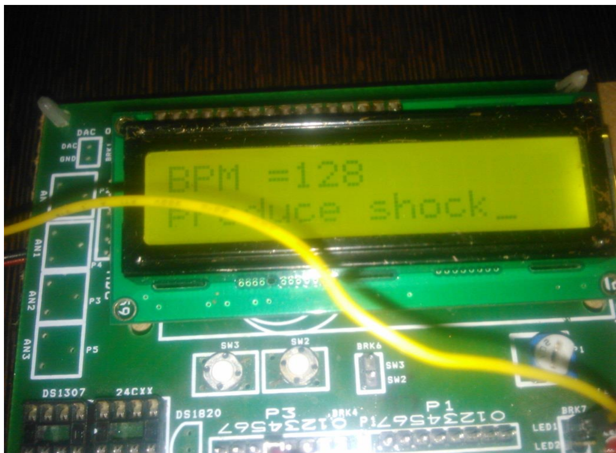
Fig5. Snap shot of the heart rate which is greater than the threshold