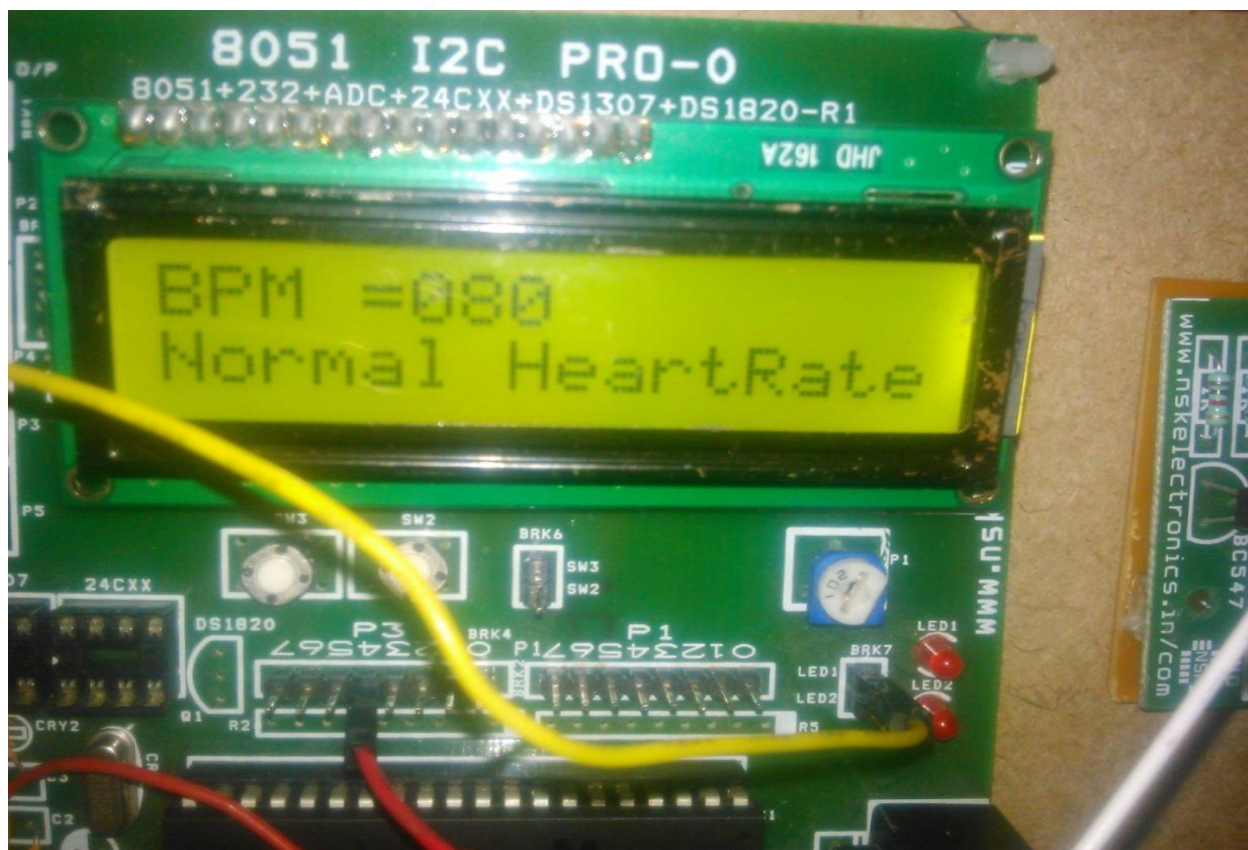
Fig4. Snap shot for the normal heart rate