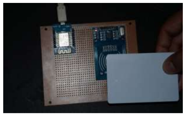
Fig.3 RFID reader scanning the RFID tags

Fig3 shows the RFID tag and reader. This component is used for identification of the products automatically. Figure 4 shows the ESP8266 Wi-Fi module.