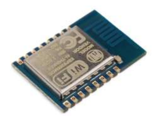
Fig.4 ESP8266 Wi-Fi module

Fig3 shows the RFID tag and reader. This component is used for identification of the products automatically. Figure 4 shows the ESP8266 Wi-Fi module.